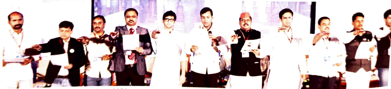
History was created on the platform of 3" Bharatiya Chhatra Sansad, when Youth Wing Heads of 10 political parties of India came together History was created on the parties or india came was to appeal to the assembled student leaders to join the political process of the country for nation building and to strengthen the democratic fabric of our nation.